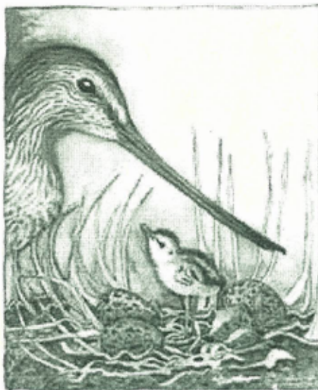
Godwit Days Poster Art, Joan Dunning

The 2-day session will be held on a weekend, starting at 9 am and ending at 4 pm each day. Topics will include inside lectures as well as outside walks and observation of marsh ecology, so dress accordingly. Please bring a lunch; FOAM will provide morning bagels and drinks. Trainers will cover the following topics: tours and interpretation, birds, wetlands biology, plants, local history, and wastewater treatment.