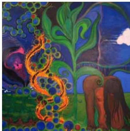
“Corn” by Reba Melfa.

☛ Some visitors specifically thanked their tour leaders; others shared sentiments such as “back for a second look,” “great use of land,” “wonderful birds, wildflowers, walking, and visitor center,” “so much to see and do,” “outstanding area to visit and bird,” “thanks for the educational job you do for young and old,” and “I will come back!”