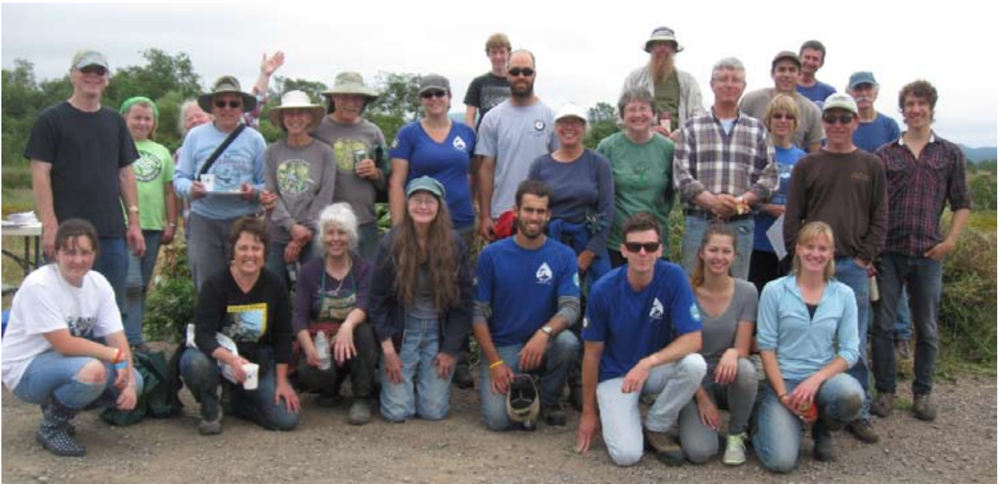
A portion of the July 21 Together Green Salt Marsh Restoration Crew.