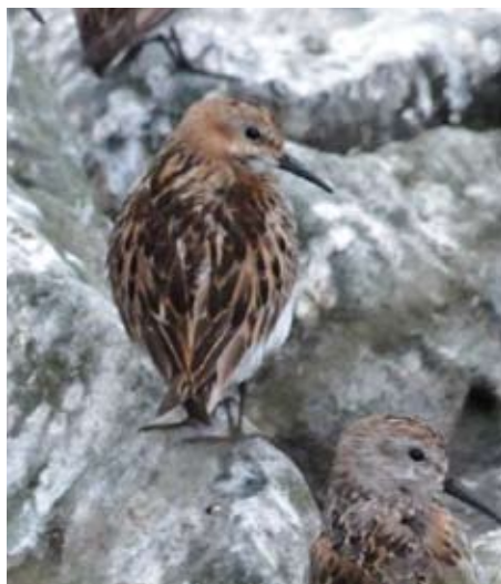
Little Stint © Tony Kurz.