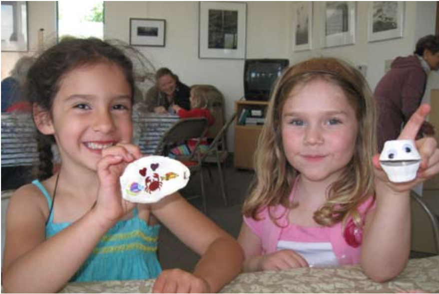
Crafters show off their oyster shell refrigerator magnet and egg carton oyster.