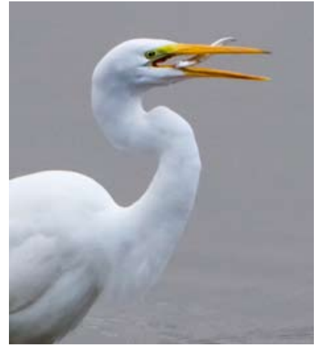
Fish Gulp (above) and I Street Dock (below) by Greg Smith.

My goal is to create an image that evokes an emotional response. I photograph anything I consider beautiful or interesting. I spend a moment or two pondering how the subject might look as a printed image--for printed images and real life differ mightily. If it looks good, I shoot. If it still looks good, I keep shooting, one of the blessings of the digital age.