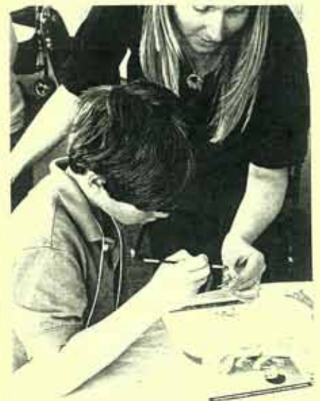
(Immediately above) Godwit Days family nature craft activities.