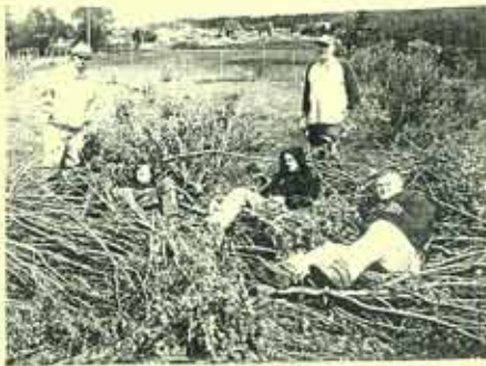
Students from the Educational Resource Center helped clean up the Marsh for Godwit Days by picking up trash and removing Scotch Broom.