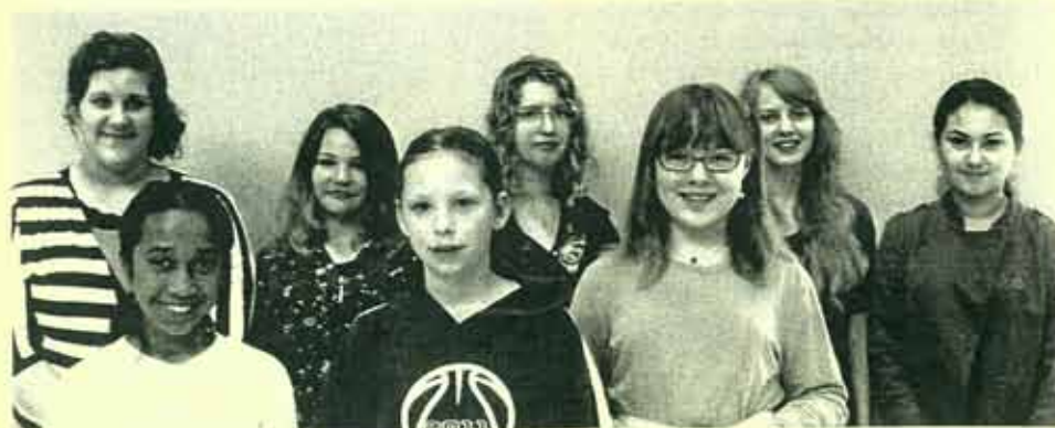
(Top) Art contest winners in Kindergarten through Grade 2.