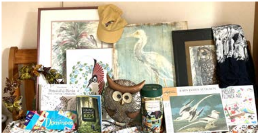
Just a smidgen of the prizes that will be up for grabs at the new members' reception in early 2026.