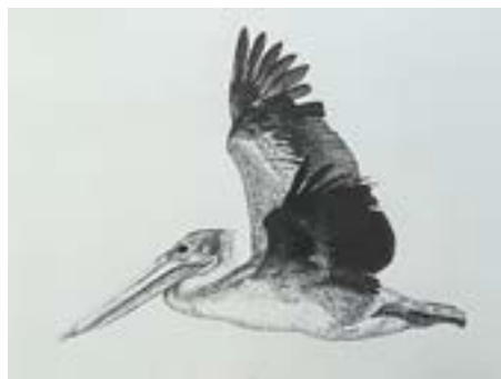
Pelican pen-and-ink by Berti Welty.

Copies of most of these prints are available at a reasonable price. Interested persons can contact me at bertijo@humboldt1.com .