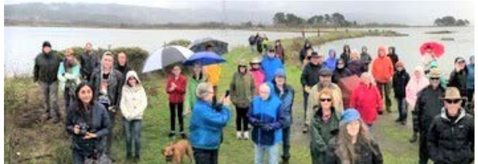
A portion of the King Tide Tour crowd of 70+ in January 2020.

Lectures begin at 7 pm at the Interpretive Center. The November lecture will be in-person only; the December session likely also will be livestreamed via Zoom.