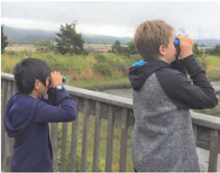
Campers using FOAM-donated binoculars.

ed several birdwatching and family outdoor websites and sent Elliott the results. The Board voted to purchase 12 pairs of binoculars, with a spending limit of $400.