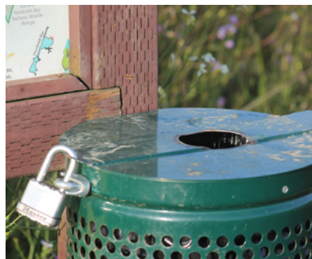
Newly locked DoggiPot.

Our South G Street neighbor Humboldt Pet Supply has stepped up again, offering a COVID-careful way for folks to clean up the Marsh. On July 25, volunteers could pick up bags and scoopers at HPS, then bring their trash collections back to the store for weighing. The heaviest collection received a prize. Check out Humboldt Pet Supply’s Facebook page for further events.