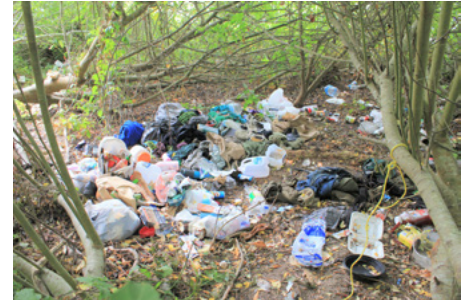
(Top) Early June, South I Street. Marsh mural was removed by a camper to roof a shelter built behind the green wall. Repaired by City staff. (Bottom) July 21, south side of Mt. Trashmore near Klopp Lake. Mess left after two campers and their pitbull vacated the site. (Not shown) Soon after solar lights were installed along the pathway leading up to AMIC this spring, someone tried to pry the top solar plates off. Luckily, City staff was able to make repairs to the system, to which FOAM had contributed half of the $6290 purchase price.