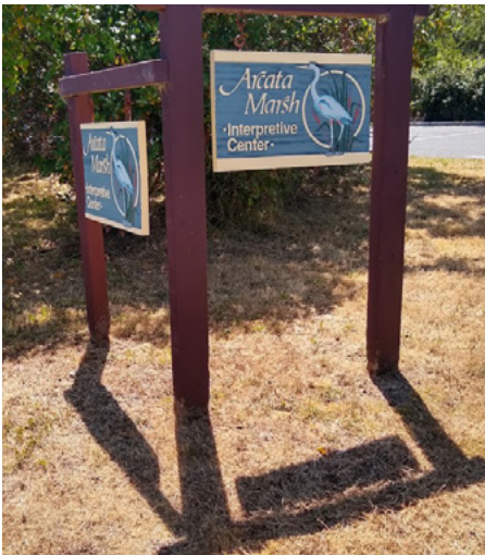
Repainted Marsh welcome signs.

ing AMIC's eventual reopening—literally, as I've finished repainting the "open" signs, too!