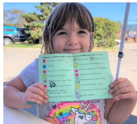
A TACO Day participant shows off her checklist.

Trees"), Redwood Community Action Agency, Redwood National & State Parks, Redwood Region Audubon Society (birdwatching, bird beaks), Save the Redwoods League, Schatz Energy Research Center (solar-powered gadgets), Scrap Humboldt, and Sequoia Park Zoo (iNaturalist, animal tracks).