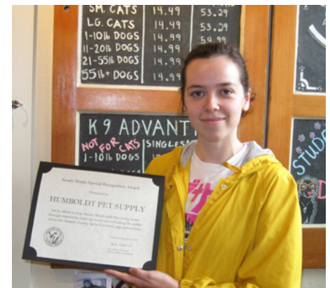
A Humboldt Pet Supply staffer shows off FOAM's certificate of appreciation for the firm's sponsorship of Arcata Marsh dog poop clean-up activities and public education efforts about the dangers of canine feces.