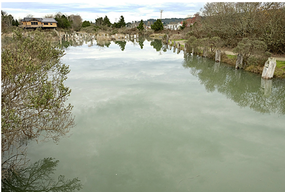
January 1 King Tide, with AMIC at back left.