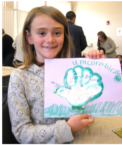
A handprint bird from Godwit Days 2017.