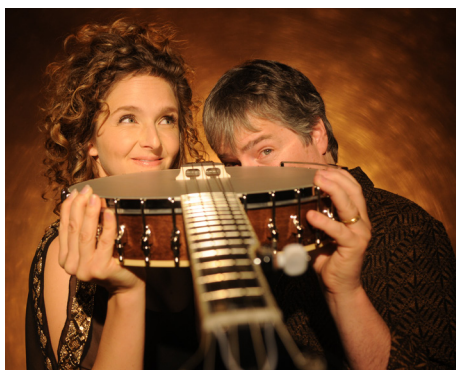
Abigail Washburn and Béla Fleck.