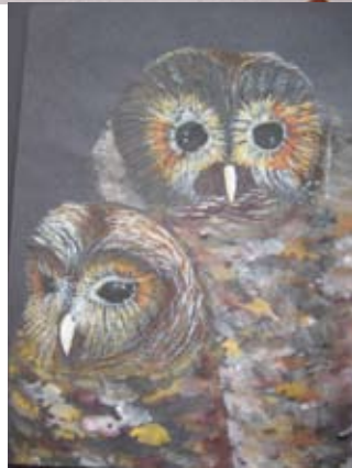
Art by She'ifa Punla-Green. (Top) Red-breasted Nuthatch , 2005. (Bottom) Spotted Owls , 2012.