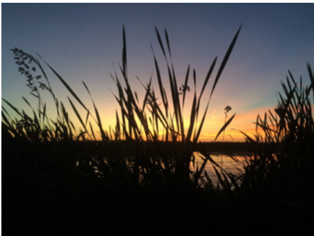
Twilight photos by Akexa DeJoannis.

Dress warmly. Meet at the first parking lot on South I Street, on the left coming from Samoa Boulevard (just before the yellow gate). Bring a flashlight if you wish. Call (202) 288-5174 with questions.