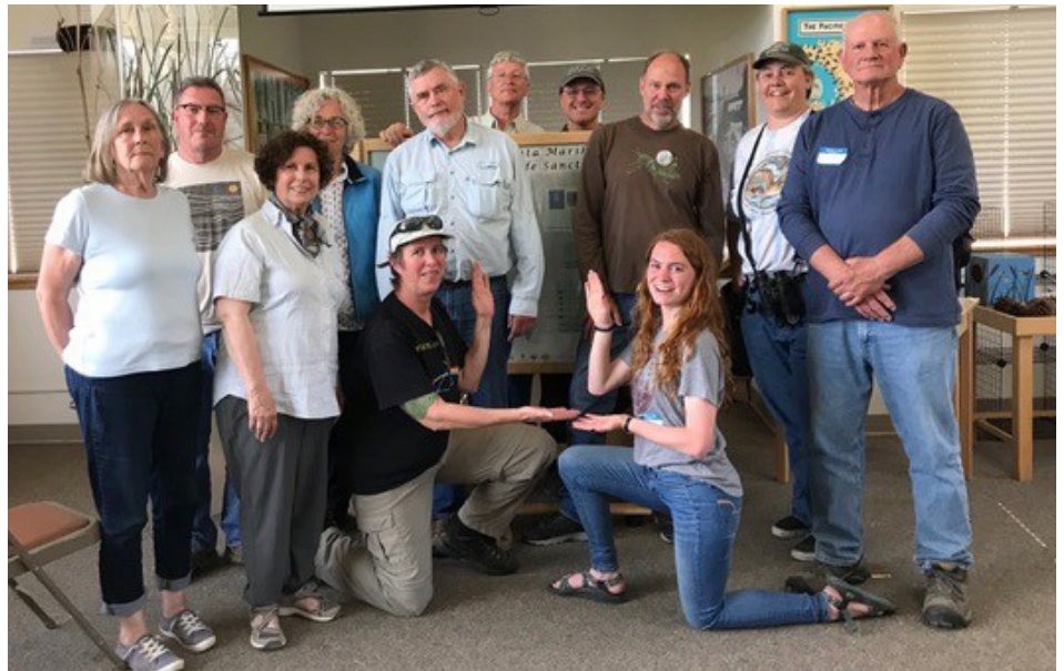
Some of the participants in the July 20-21 docent training.

► Five interpretive signs that were vandalized several years ago have been replaced, with FOAM splitting the cost with the City. They are "Where rivers meet the sea," "Taking flight on Klopp Lake,"