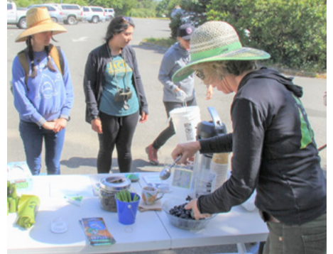
Scenes from the HPS Marsh clean-up effort.