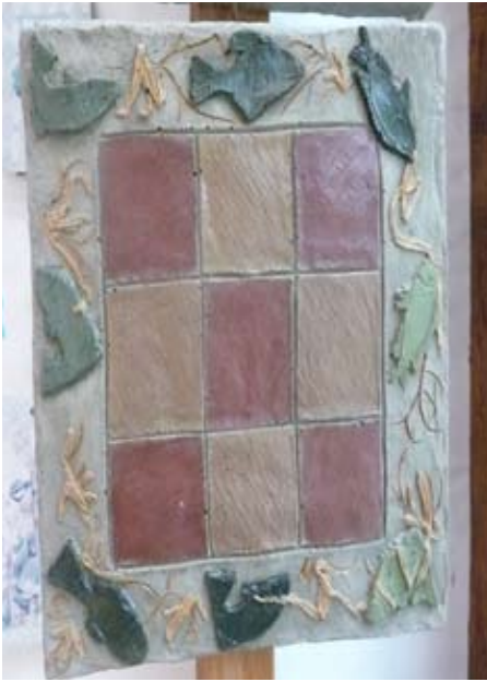
Fish tic-tac-toe garden art.